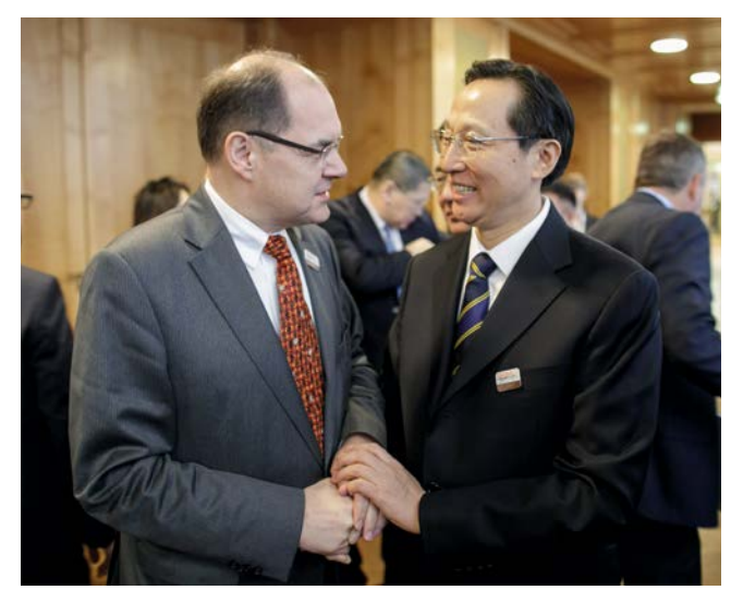
Federal Minister Schmidt welcoming his Chinese colleague Han Changfu

The breakout session on access to water was chaired by Australian Minister of Agriculture Barnaby Joyce. As the results of the deliberations, he stated that the right to water, set out in the Sustainable Development Goals (SDGs), could help to secure sustainable access to water for all. However, he said that the food-water-energy nexus needed to be considered in this regard: A 60 percent increase in food demand by 2050 meant that at the same time the demand for energy would increase by 50 percent and the demand for water by 55 percent. He stated that the governance of water resources therefore played a key role but that this governance was still too fragmented, from local level right up to international level under the UN. He went on to say that better coordination was therefore required between different sectors (agriculture, environment, energy, mining, etc.) and countries as well, and that effective institutions played a pivotal role to ensure sustainable access to water. Furthermore, Minister Joyce highlighted the importance of adequate investments in, for example, water storage, the distribution network and the modernisation of the irrigation infrastructure. He concluded by saying that affordable water resources such as rain water and appropriate waste water should also be used to a greater extent.