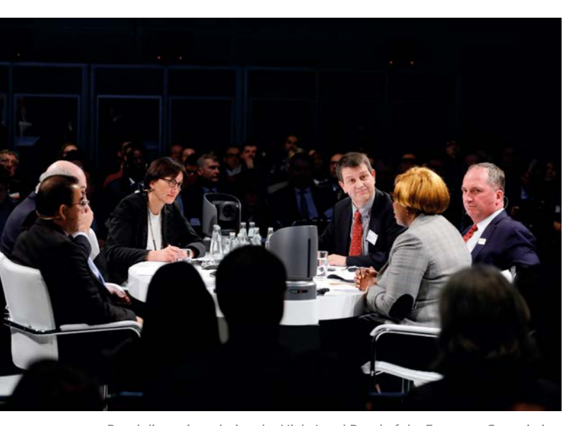
Panel discussions during the High-Level Panel of the European Commission

They agreed that these and other measures had to be integrated at national and local level into medium- to long-term strategies.