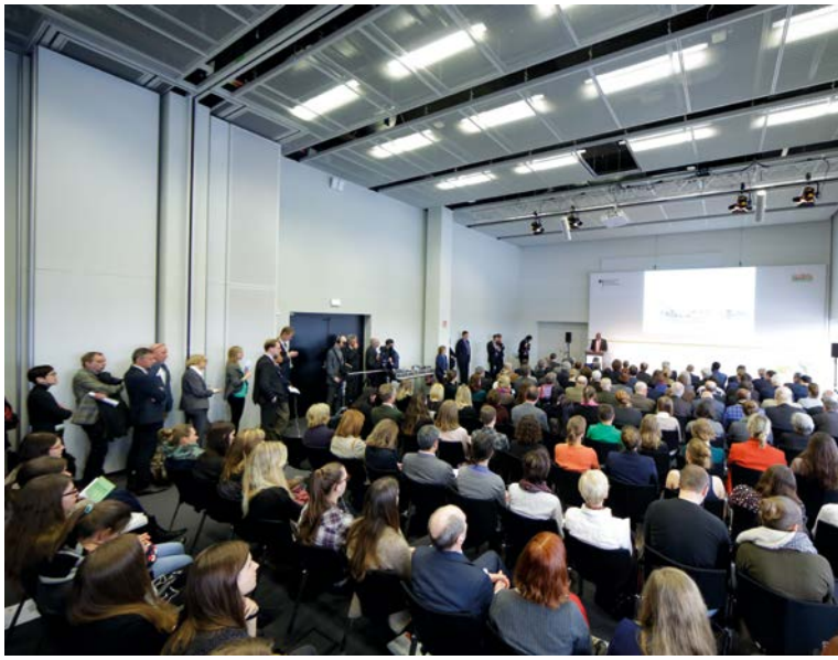
Not an empty seat left during the expert panel discussions