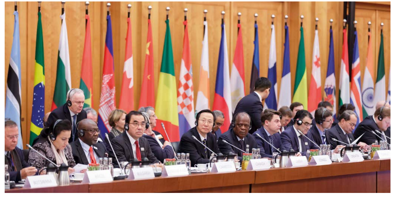
Participants of the Berlin Agriculture Ministers' Conference 2017 in the Weltsaal of the Federal Foreign Office

Blairo Maggi, Brazilian Minister of Agriculture, reported from the session on surplus water: He said that the phenomenon was global and would therefore, like the resulting ramifications, need to be seen in the context of climate change. He continued by saying that water surplus was often only a temporary occurrence and required cross-regional coordination and suitable infrastructure (dams, polders, etc). He stated that water stor-