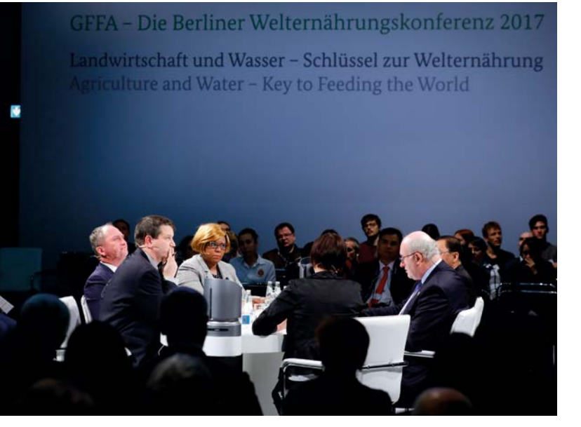
High-Level Panel of the European Commission

The events, which were almost all booked out, allowed panellists from various areas of expertise to contribute their views and perspectives. For instance, the advantages of water-efficient drip irrigation were set out, as well as the requirements that need to be met to ensure that the use of waste water in agriculture is harmless to health and accepted by all parties concerned. It was repeatedly demonstrated how smart water management strategies could both decrease water consumption and increase agricultural yields at the same time. With reference to the Agenda 2030 objectives for the water and agricultural sector, the participants voiced support for innovative solutions that took into account the entire value chain of food production, i.e. the production areas, the crops, the production process and the supply chain.