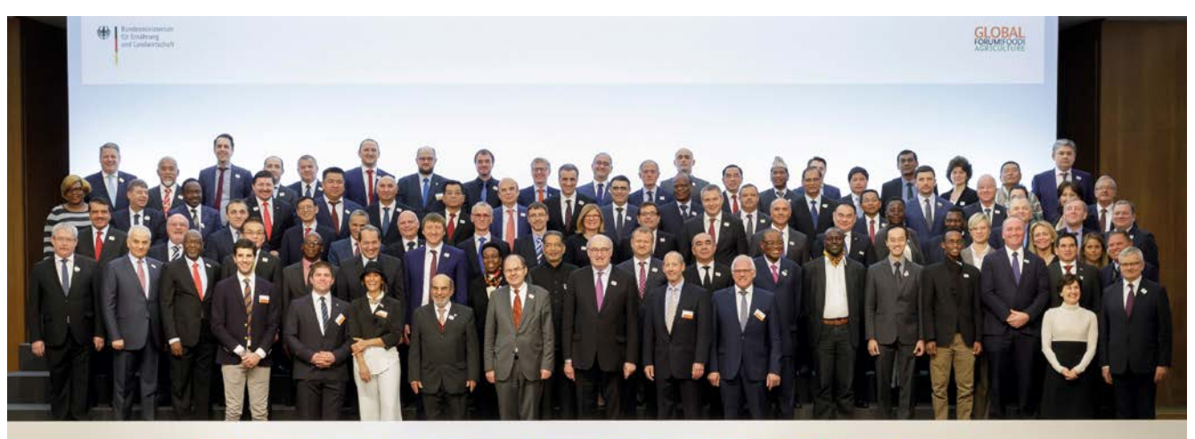
GFFA - Die Berliner Welternährungskonferenz 2017

Participants at the Berlin Agriculture Ministers' Conference 2017