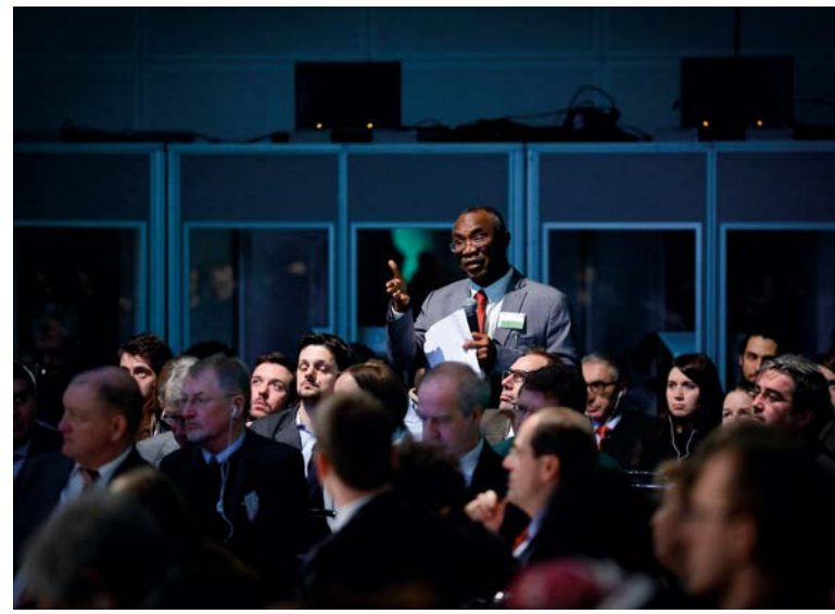
Questions from the audience