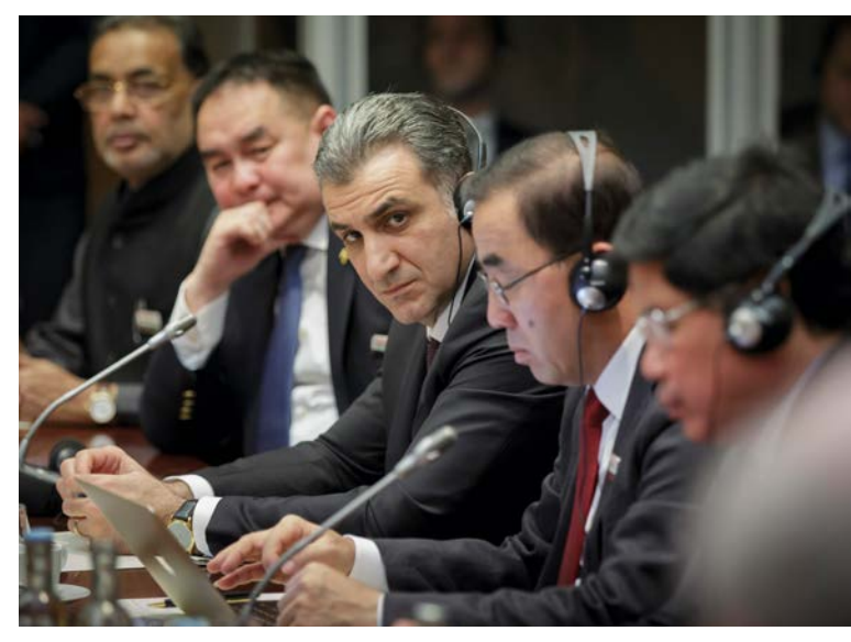
Agriculture Ministers during the breakout sessions

On behalf of the EU Commission, Agriculture Commissioner Phil Hogan stated that water was a human right while being a prerequisite for food production at the same time. He said that reliable food supply chains therefore required smart and sustainable water strategies. He continued by saying that there was a lot to catch up on in this regard, despite the necessary knowledge being available, and that the final communiqué that was to be adopted was therefore another important step. The following results were concluded from the High-Level Panel hosted by the EU: