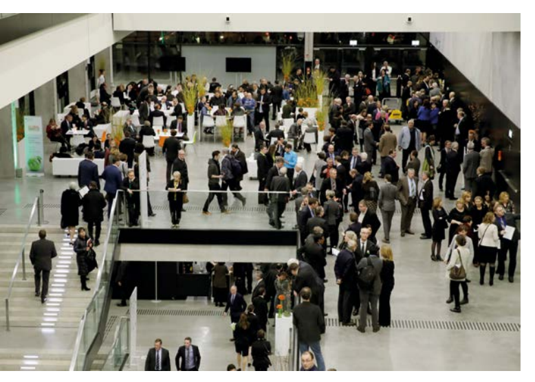
View of the Business Lounge