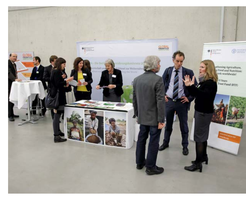
Information exchange at the stand of the German Federal Ministry of Food and Agriculture on the topic of the Bilateral Trust Fund (BTF)

related to the GFFA topics that the BMEL has promoted in recent years. These projects demonstrate that key GFFA topics are not only discussed in theory, but that they are directly anchored "in the fields" via the so-called "Bilateral Trust Fund". The "Bilateral Trust Fund" is a programme operated by the BMEL and the FAO in which selected food security projects are carried out in a number of countries. Here, the GFFA topics are reflected at operative level and implemented in concrete projects. The FAO implements the programme, whilst the BMEL provides the financial base. This has enabled roughly 100 projects to be carried out since 2002, channelling a total of approximately 121 million Euros.