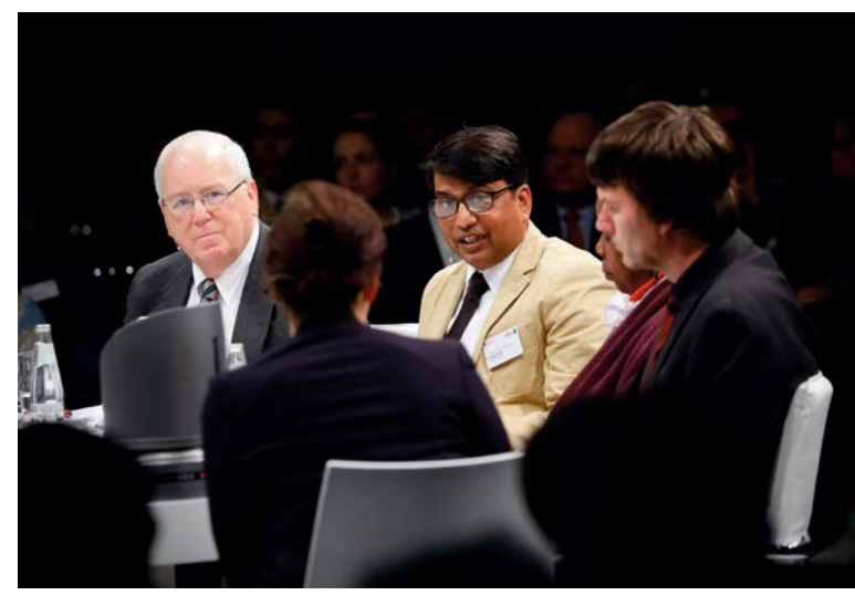
Impression of the discussion during the FAO's High-Level Panel

same time steps needed to be taken to give farmers, in particular poorer small-scale farmers, guaranteed access to water. He added that access to water was after all a human right and this right included farmers.