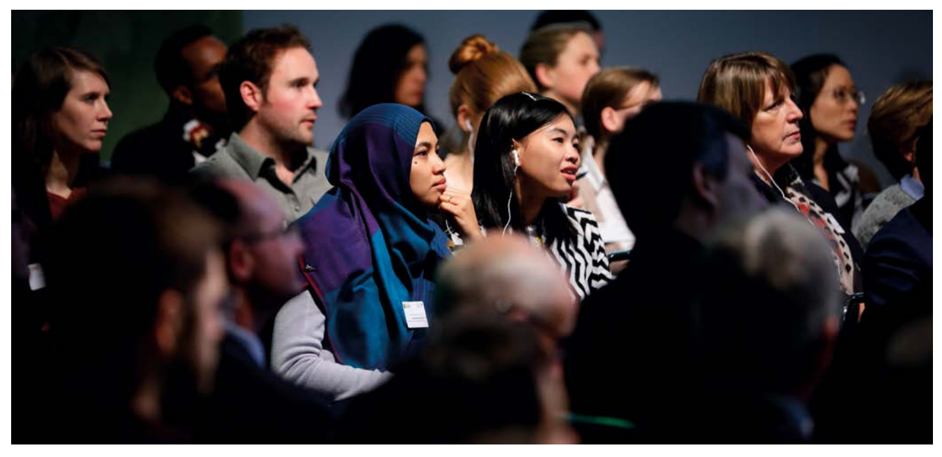
Audience at the High-Level Panel of the European Commission

Both the panellists and the members of the audience that participated in the discussion emphasised that all stakeholders – i.e. policy-makers, economic operators, scientists and representatives from civil society alike – needed to be involved in order to better address the challenges posed by dwindling water resources. They agreed that agriculture and water were two topics that went hand in hand and that it was necessary to think outside the box to be able to successfully develop and implement multi-sectoral approaches.