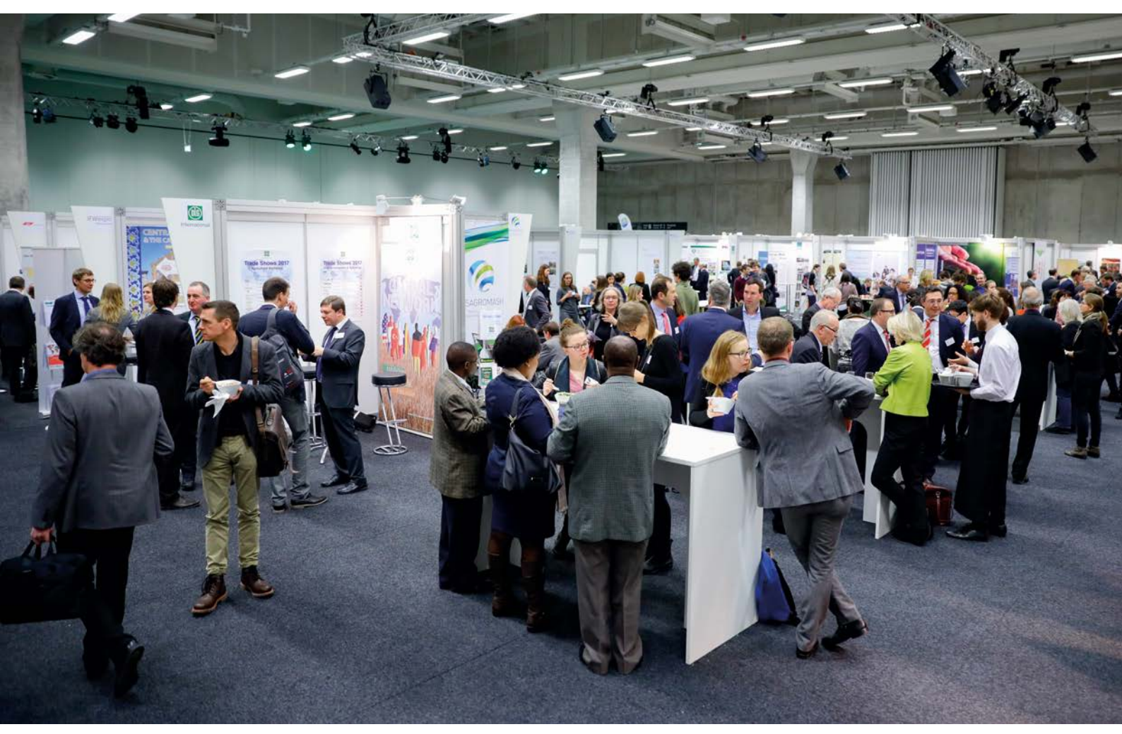
The Cooperation Market 2017